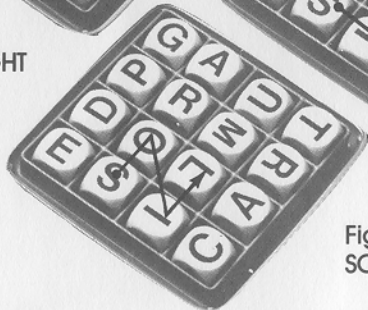
Figure 3 SOIL