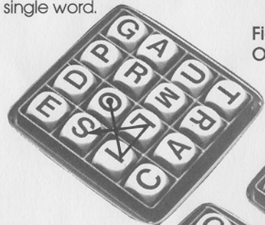
Figure 1 OILS (and OIL)

Words are formed from adjoining letters . Letters must join in the proper sequence to spell a word. They may join horizontally, vertically, or diagonally to the left, right, or up-and-down. No letter cube, however, may be used more than once within a single word.