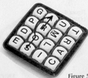
Figure 5 SOAR

In Figure 4 (SOILS), the one S is used twice. In Figure 5 (SOAR), the letter R was skipped; letters must join in sequence.