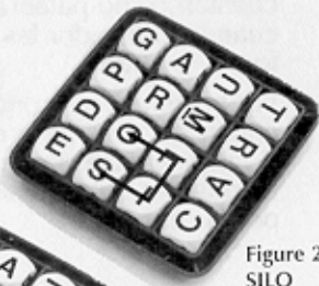
Figure 2 SILO