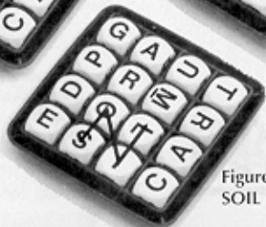
Figure 3 SOIL