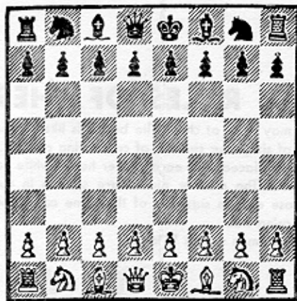
Arrangement of Men at Commencement of Game

Upon arriving at the opposite edge of the board (the eighth square) the Pawn may change its value to that of any piece except the King. The Bishop moves diagonally to any clear distance, forward or backward, keeping upon a square of its original color and capturing wherever it has a right to move. The Knight's move is one square to either the right, left, forward or backward, and thence to a second square diagonally in the same general direction. Thus in the diagram although the Knight is completely surrounded, he can move to either of the outside darker squares.