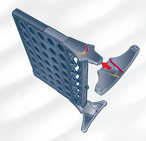
Attach feet to the sides of the grid.