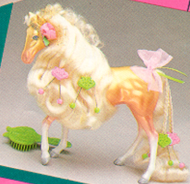
Lani™ The flirtatious Palomino from Southern California.