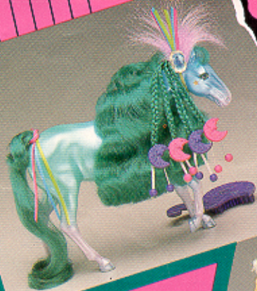
Dara™ The outrageous and unpredictable Andalusian from Italy.