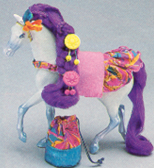
BeachStar Beauty™ swimwear