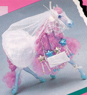
FiveStar Wedding™ gown

Fun fashions have been specially designed to make your filly look her best. You can have the excitement of your own fashion show by collecting all four of the beautiful FashionStar Fillies™ fashions.