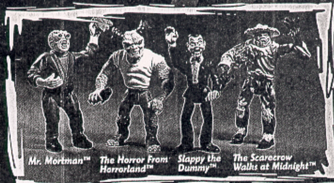
Mr. Mortman™ The Horror From Horrorland™ Slappy the Dummy™ The Scarecrow Walks at Midnight™

Includes cutting tool, bag filled with water-absorbent granules, 6 character parts and 3 accessories.