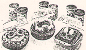
Photo shows items made with some colors not available in this set. Molded results may vary depending on child's age and level of skill.

Make beautiful jewelry with the Jewels & Gems™ Assortment! (Sold separately.)