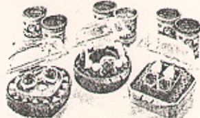
Photo shows items made with some colors not available in this set. Molded results may vary depending on child's age and level of skill.

Make beautiful jewelry with the Jewels & Gems™ Assortment! (Sold separately.)