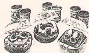
Photo shows items made with some colors not available in this set. Molded results may vary depending on child's age and level of skill.

Make beautiful jewelry with the Jewels & Gems™ Assortment! (Sold separately.)