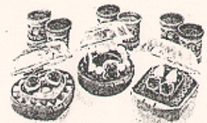
Photo shows items made with some colors not available in this set. Molded results may vary depending on child's age and level of skill.

Make beautiful jewelry with the Jewels & Gems™ Assortment! (Sold separately.)