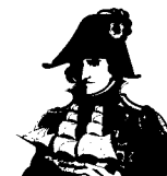
ADMIRAL Offense Attack by sea

Admiral. Used to move your armies via the Admiral's ship from a territory on the sea to attack an enemy's territory on the sea.