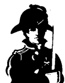
GENERAL Offense Add 1 to high die

General. Used offensively to add 1 point to your high die roll.