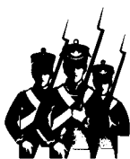
REINFORCEMENTS Add armies Play at start of turn

Reinforcements. Used to recruit additional armies to place in one or more of the territories you occupy.