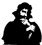
SPY Spy on opponent or Defend against Spy

Spy. Used to look at a player's hand in order to eliminate a card from it, OR to defend against another Spy card.