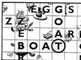
Example 4: If you cover the T to complete BOAT and GOAT, collect two scoring chips!