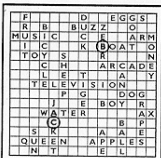
Example 2B: ...but decides to start BOAT by covering the B, and continue JACKET by covering the C.