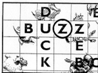
Example 5: If the B and U in BUZZ are covered, and the Z in ZEBRA is already covered, complete BUZZ by covering the first Z—then collect a scoring chip!