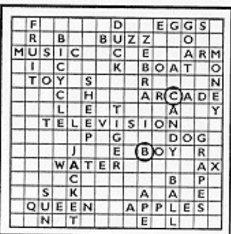
Example 2A: The second player could start CANDY and BOY by covering the first letter of each word...