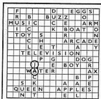
Example 1B: ...but decides to cover both the J and the A in JACKET, instead.