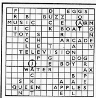
Example 1A: The first player could start JACKET and ARM by covering the first letter of each word...