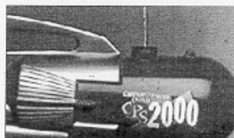
2. Fill water reservoir with clean, clear tap water. Replace fill cap.