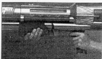
4. Pull trigger to shoot. Repump after each shot.