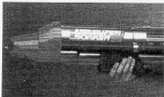
3. Pump to pressurize.