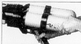
1. Unscrew bottles.