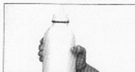
2. Fill bottles approximately 2/3 full with clean, clear tap water only.