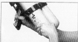
3. Screw both bottles in position threading pick up tube into each bottle.