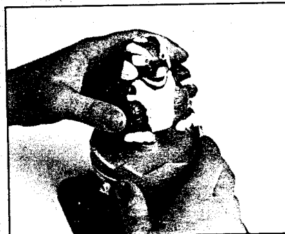
2. To start the timer, gently press Eggzilla down onto the egg peg.