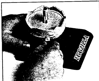
1. Apply labels where shown. Move timer arm to Normal, Challenge or Eggspert.