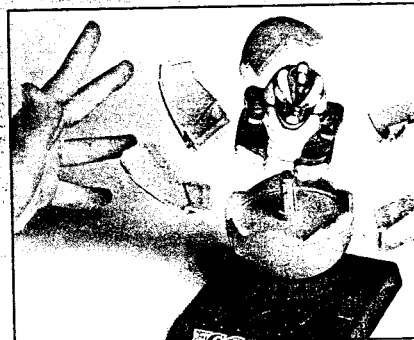
4. ...before the eggshells shatter and Eggzilla pops out!