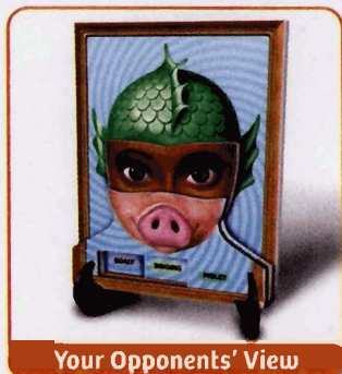
Your Opponents' View