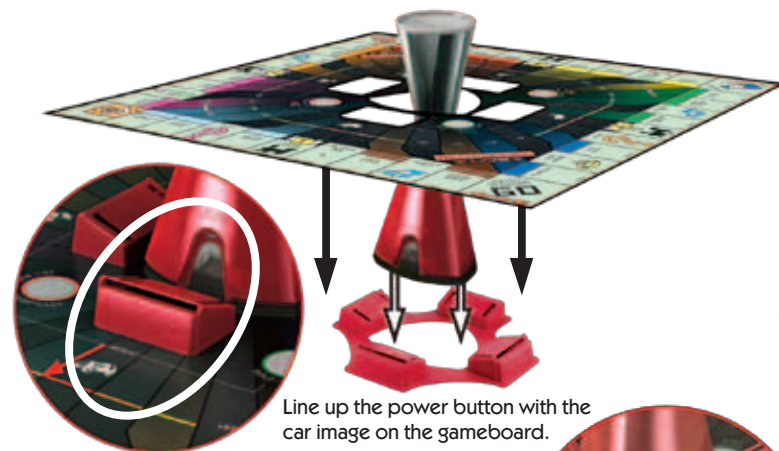
Line up the power button with the car image on the gameboard.