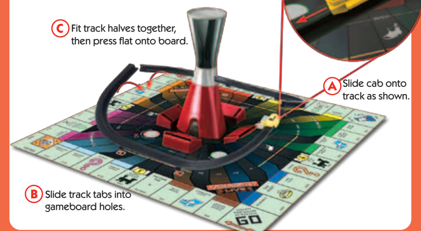
Fit track halves together, then press flat onto board.